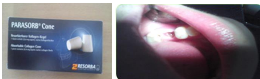
Fig. 2. Preservation of alveol with Parasorb® Cone

smokers, COPD, etc.). Reduction of the atrophy of the alveolar ridge and the support of the vestibular lamina provide stabilization of the alveol and alveolar process, which ensures the preservation of aesthetic and functional results from a long-term perspective. [1,2,6]