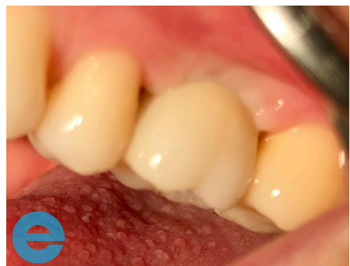
5. Loading at 12 weeks