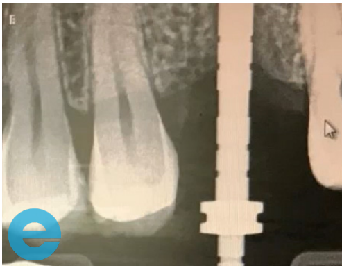
2. 3 months following extraction