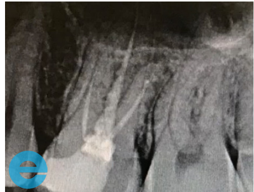
1. Initial situation - issue with previous root canal treatment

Case from Dr Andrew Fish, Jersey Channel Islands