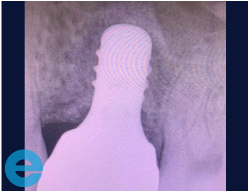
8. 3 years loaded