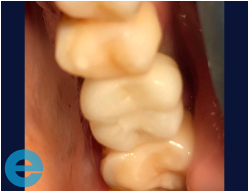
6. 6 months loaded