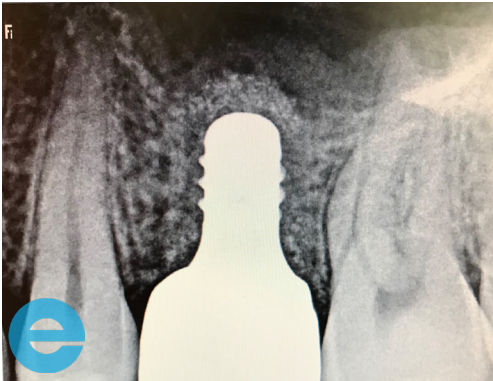
7. 6 months loaded