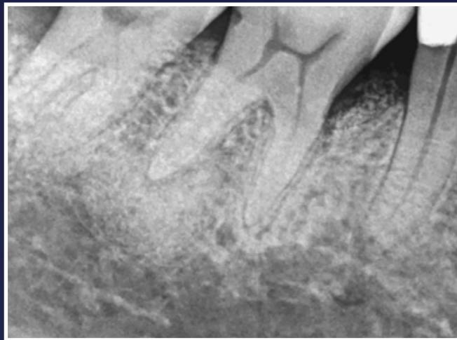
13. Result at 6 months, expect further improvements over time