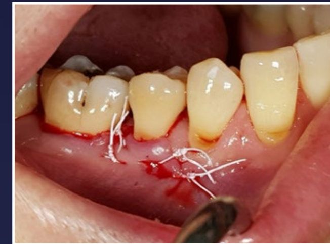
7. Passive closure