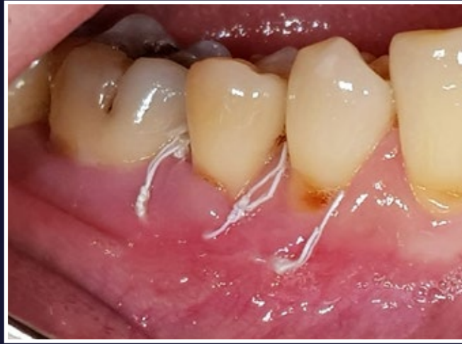
9. 1 week healing post-op