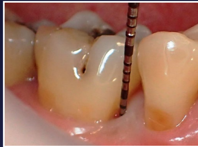
12. 6 month post-op, 3mm PPD