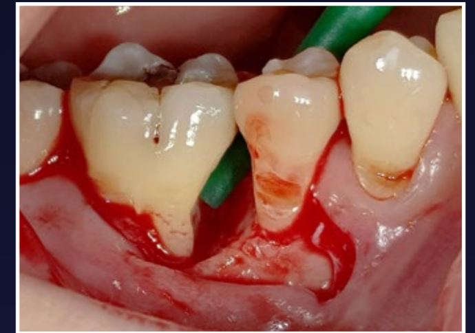
5. Following cleaning defect is visible - apically 2 walled, coronally 1 walled