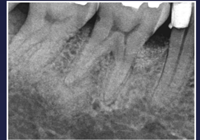
8. Radiograph immediately post-op