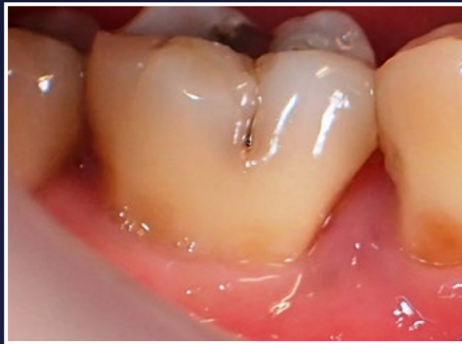
11. 6 months post-op, good maintenance of interproximal tissues