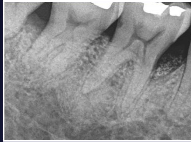
10. Radiograph at 1 month note post-op. Slight radiopacity to be expected as the Calcium Sulphate resorbs