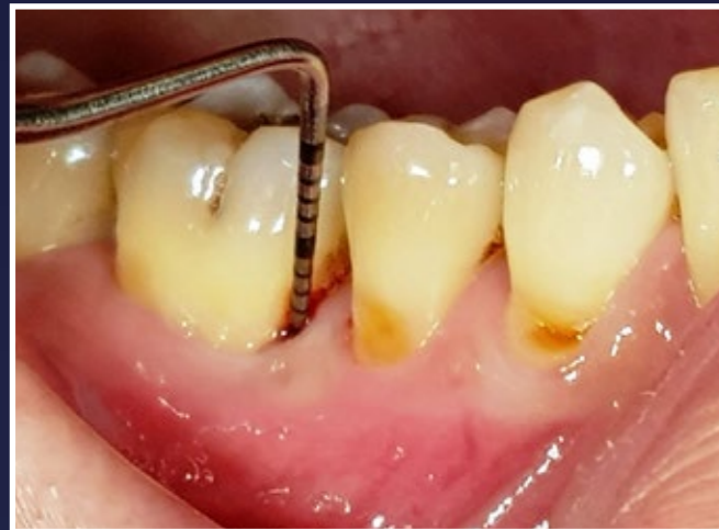
2. Initial situation - 6mm PPD