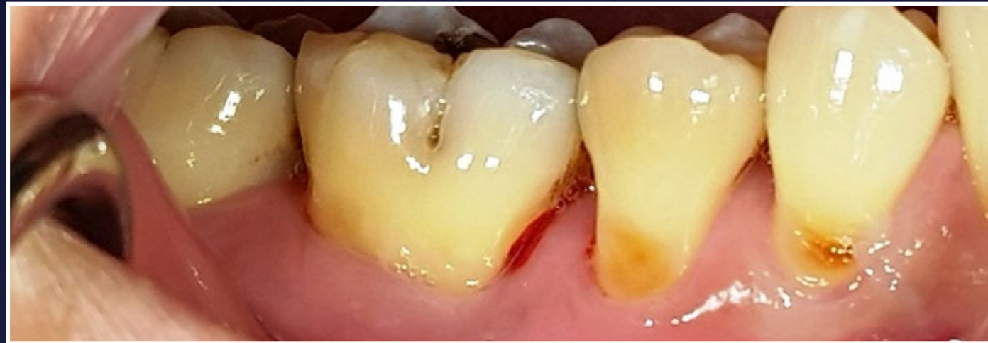
1. Initial situation