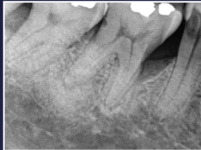
3. Initial situation - radiograph