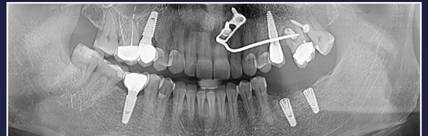
8. Panoramic radiograph at 1 year and 2 months