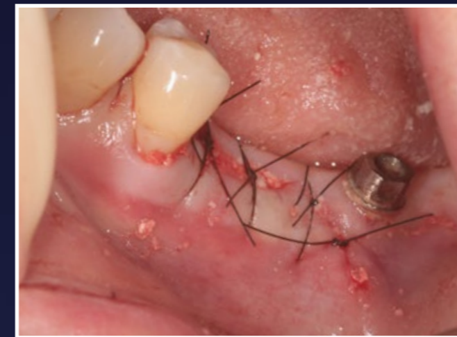
6. Sutured shut