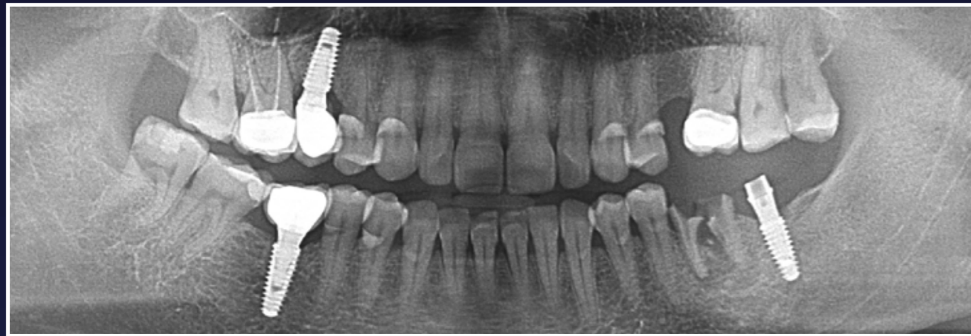
1. Panoramic radiographic - initial LL6 (36) is lost