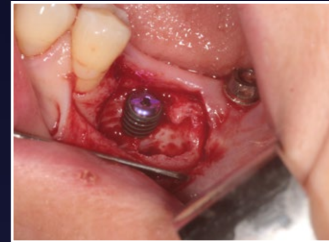
4. Implant placed