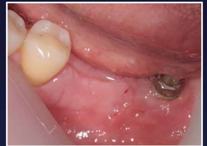
7. 11 days post op shows excellent healing