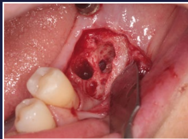
2. Two and a half months post extraction of LL6