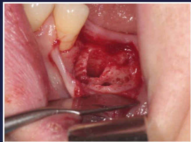
3. Large defect in bone, bad healing