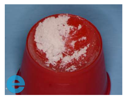
7. EthOss bone grafting material placed on container