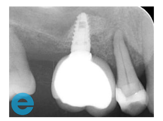
16. Loaded 4 months - radiograph