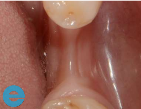
1. Narrow ridge due to modelling.