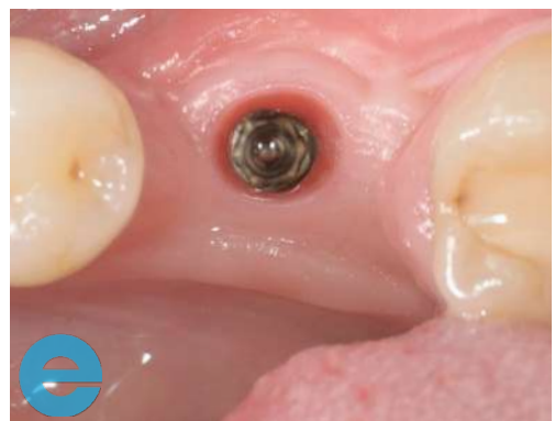
6. Also 10 week following implant placement, cap removed to take impression, there was no soft tissue grafting. 75 ISQ reading