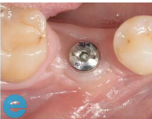
5. Implant placed at 10 weeks following graft. Image shows healing at 10 weeks following implant placement