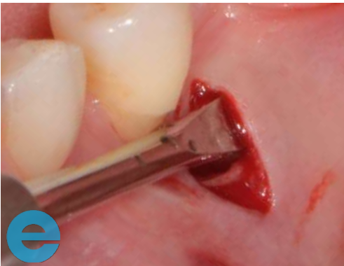
3. Incision distal to 5, periosteum lifted.