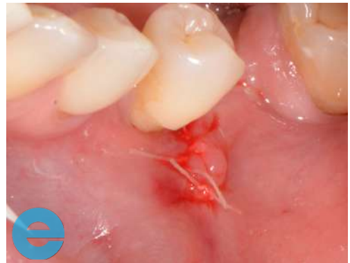
4. EthOss® placed with graft gun and sutured closed.