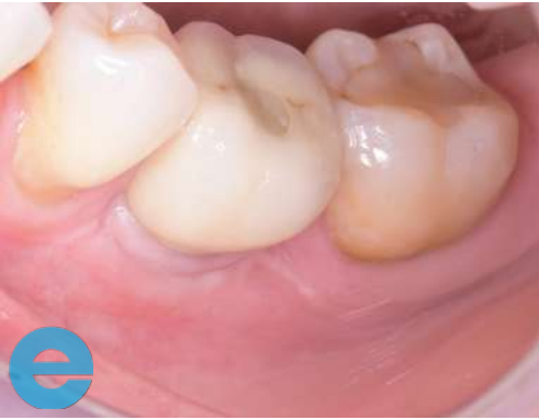
9. Loaded 3 years