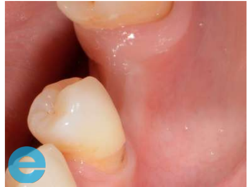
2. Narrow ridge and reduced keratinized gingiva.