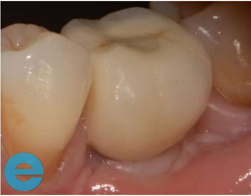
7. Loaded 9 months