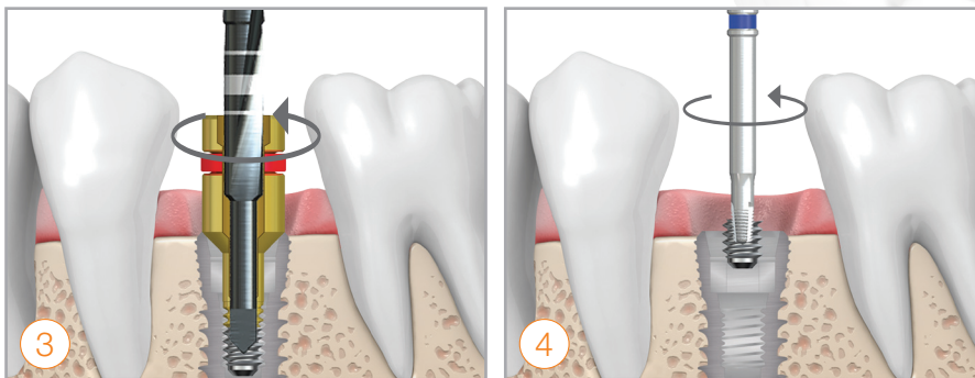
3 Reverse Drilling