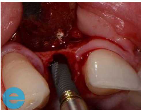
4. Osstem implant placed slightly palatally