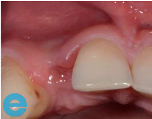
2. 3 weeks post extraction, some papilla loss