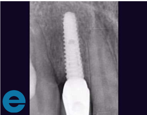
8. Radiograph showing stable site