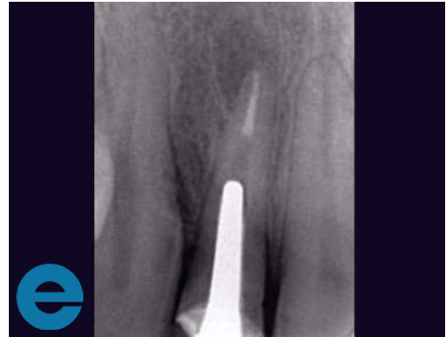
1. Initial situation. Root fracture and bone loss at apical area