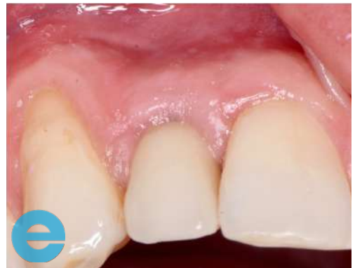
9. Loaded 3 years – note soft tissue healing and papilla recovery