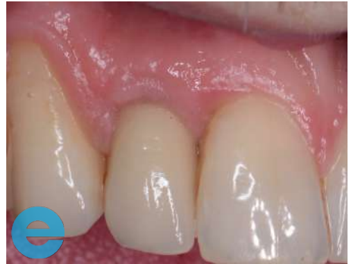
7. Loaded 3 years – nice tissue healing, although little inflammation due to loose abutment