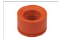
ADS3 Adaptor silicone, 19721410 Adaptor silicone for AUF1. For connection of transmission instruments with diameter of approx. 22 mm (red).