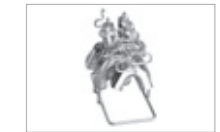
E522/1 Insert, 19721428 9 holders for dental impression plates. H 140, W 100, D 190 mm