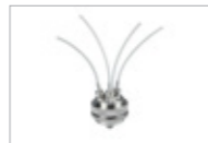
A813 Adaptor, 19721413 For reprocessing of up to 4 transmission instruments with external spray channel. To be used on A105/1 upper basket.