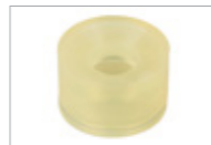
ADS1 Adaptor silicone, 19721408 Adaptor silicone for AUF1. For connection of transmission instruments with diameter of approx. 20 mm (white).