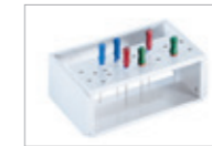
E520 Insert, 19721426 For 18 root canal instruments hinged. Can be sterilised in steam at 121°C/134°C. H 45, W 75, D 30 mm