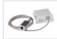
XKM RS232 10 Med Serial module, 19721432 Serial module