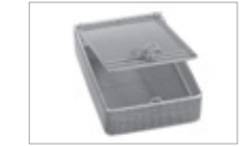
E363 Insert 1/6 mesh tray, 19721421 Mesh size 1 mm, with lid (without receptacles for instruments) H 55, W 150, D 225 mm