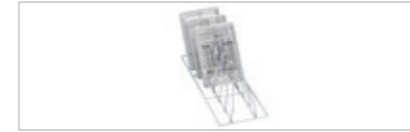
E198 insert 1/2, 19721419 For 6 mesh trays/kidney dishes. 7 holders (6 compartments). H 160, spacing 66,5 mm (compatible with mesh tray E197) H 160, W 180, D 495 mm