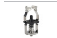
A803 Holder, 19721411 For transmission instruments (suitable for a wide range of various manufacturers) on A105/1 upper basket with A800 central filter.