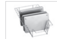
E339/1 Insert, 19721437 Insert for trays