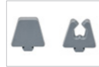
E476 Adaptor, 19721425 Adaptors for use in trays with 5 mm mesh. For transmission instruments with a diameter of 4 to 8 mm (50 per bag).