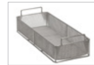
E379 Insert 1/2 mesh tray, 19721422 Wire mesh with 2 handles. Mesh size 1,7 mm, 80 (+30), W 180, D 445 mm