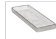
E430/1 Insert 1/3 mesh tray, 19721423 Wire mesh. Mesh size 5 mm H 40, W 150, D 445 mm