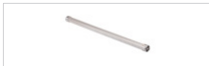
A800 Central filter, 19721404 Filter made from multiply stainless steel mesh for A105/1 upper basket. Mesh size 63 µm. Can be cleaned with A804 cleaning brush. L 405 mm, Ø 22.5 mm