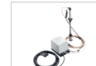
DOS K85/1 200-240V 50Hz, 19721435 Dispenser module