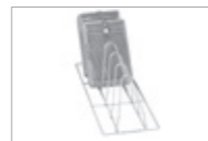
E131/1 Insert, 19721416 For optimum loading of 5 mesh and kidney trays. H 168, W 180, D 495 mm