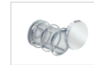
E473/2 Insert, 19721424 Mesh basket with lid for small parts. For hooking onto mesh trays. H 85, W 60, D 60 mm