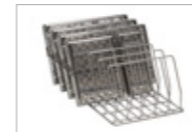
E523 Insert 1/2, 19721429 For mesh trays: 7 holders (6 compartments). H 145 Spacing 50 mm, H 151 W 220, D 450 mm