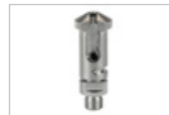
A814 Adaptor, 19721430 For reprocessing of various types of scaler tips. To be used on A105/1 upper basket.