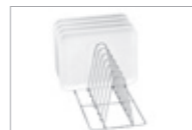
E130 Insert 1/2 for 10 trays, 19721415 11 holders (10 compartments). H 170, spacing 35 mm, H 180, W 180, D 445 mm