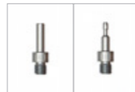
Adaptor, 06894700, 06895000 For W&H air scaler tips. For W&H Piezo and Prophylaxis tips. Can be connected to A813.