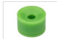
ADS2 Adaptor silicone, 19721409 Adaptor silicone for AUF1. For connection of transmission instruments with diameter of approx. 16 mm (green).