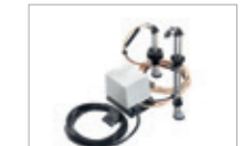
DOS K85/1 200-240V 60Hz, 19721443 Dispenser module