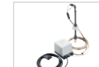
DOS K85/1 NER, 19721442 Dispenser module for Scandinavia