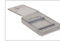
E197 Insert 1/6 mesh tray, 19721418 Wire mesh. Mesh size: Base 3 mm, sides 1,7 mm, lid 8 mm, H 42, W 150, D 225 mm