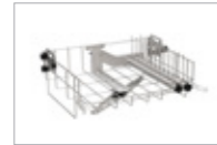
A105/1 Upper basket/injectors, 19721455 Loading: H 235, W 360, D 435 mm