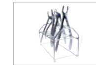
E521/2 Insert, 19721427 For 7 extraction or orthopaedic molar forceps. Compartment size 21 x 80 mm. H 135, W 100, D 189 mm