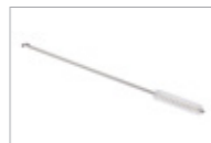
A804 Cleaning brush, 19721412 Twisted brush with spiral bristles for A800 central filter cleaning. Handle with grommet. Length 500 mm, Brush length 100 mm