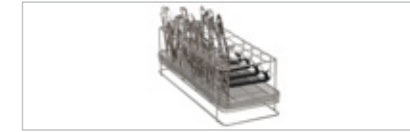
E337/1 Insert 2/5, 19721420 For instruments in upright position: 4 plastic receptacles, 12 compartments, approx. 22 x 28 mm, 4 compartments, approx. 25 x 28 mm, 48 compartments, approx. 13 x 14 mm H 113, W 173, D 445 mm